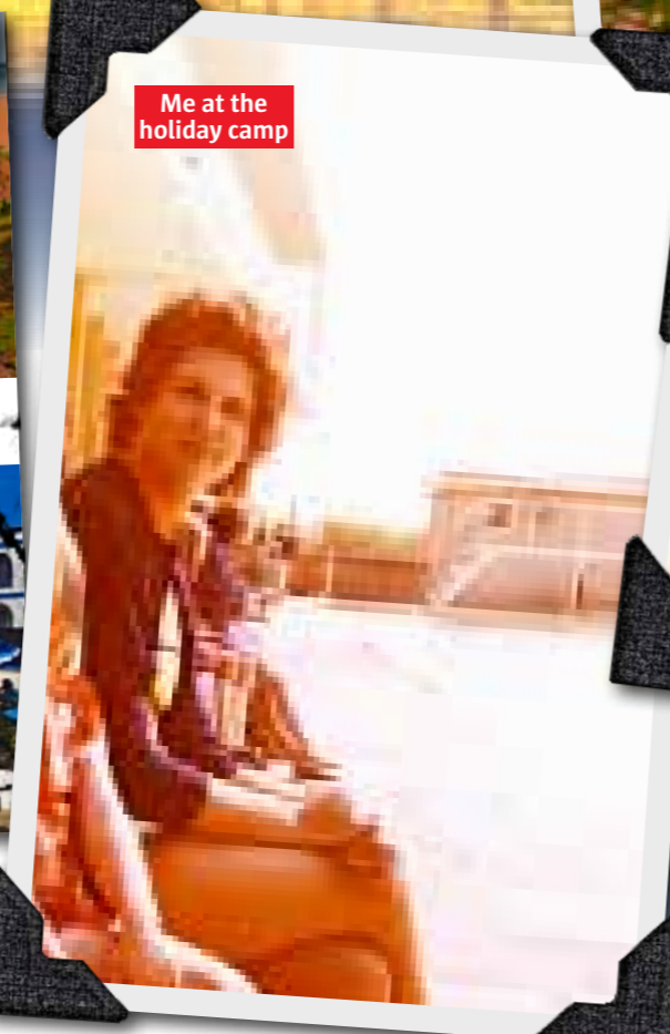
Me at the holiday camp