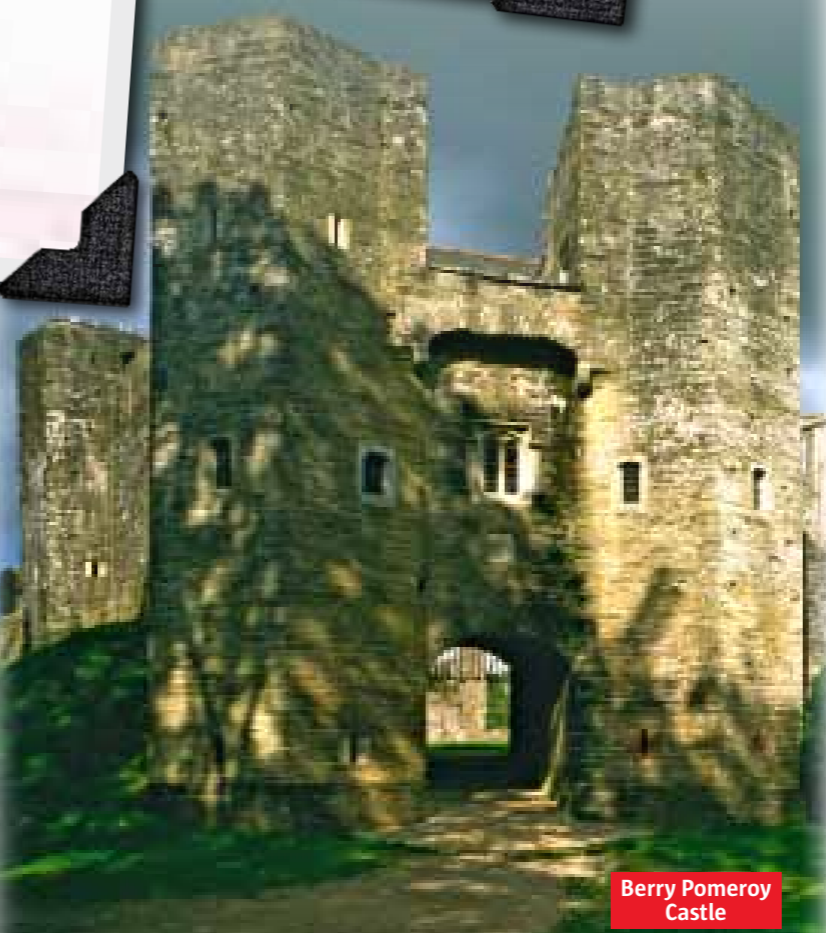
Berry Pomeroy Castle