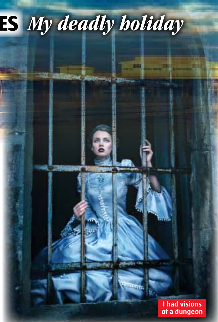
I had visions of a dungeon

ruins of Berry Pomeroy Castle, she finally wanted to rest in peace. In a strange way, I felt honoured to be the one to help her towards the light.